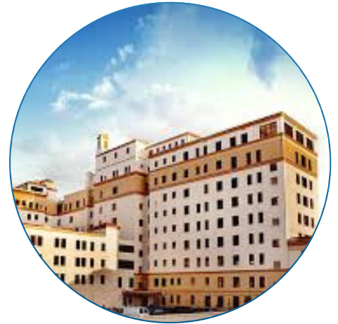
Los Angeles Dream Center transformed a hospital

Raleigh Dream Center is in search of a permanent facility to continue our impact in Wake County and beyond with our outreach and residential programming.