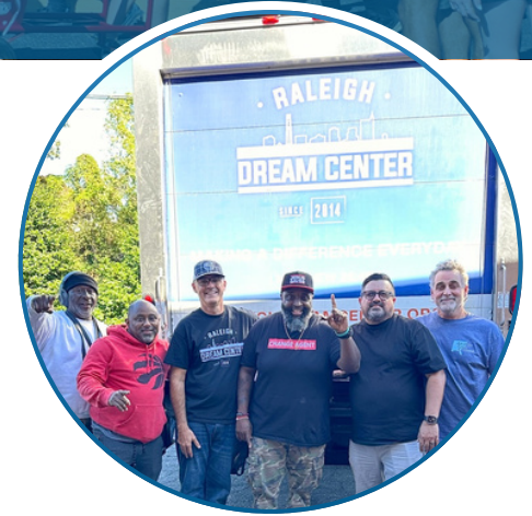
Hurricane Helene Water Rose ~15ft

“Witness people’s suffering, despair, and tiredness changes you. From hearing the first-hand accounts of loss and trauma to the background noise of endless helicopters overhead, it impacts your resolve to help by whatever means necessary. There is a profound sense of God, what He is doing, and how He makes beauty from ashes. When everyone comes together, worshiping and providing aid, hope is restored and strength is renewed.” - Volunteer