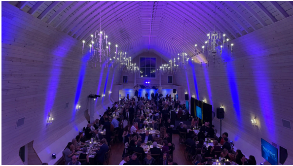
Annual Night of Dreams Gala 2024

RALEIGH DREAM CENTER 6325 Falls of Neuse Rd. Ste. 35-409 Raleigh, NC 27615